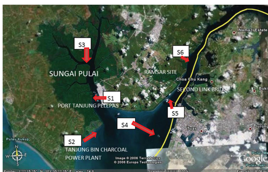
FIGURE 1. Six sampling stations in Sungai Pulai estuary, the Johor Straits, Peninsular Malaysia

A total of 12 and 14 phytoplankton species were identified during the first and second sampling session, respectively. Five species ( Pleurosigma sp., Chaetoceros